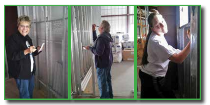
Volunteers, staff, graduates, and current residents all came together to write some of God's precious Word in the new building!

Have you driven by to see the progress being made on the Center for Advancement? Exciting things are happening. Our goal is to be finished and have an open house event in October. Be watching for your invitation. We hope that many from our community can attend and see this amazing blessing that God has provided. God is good, and cares about even the smallest details of our new project!