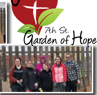
Street Toyota Volunteers

We had a wonderful group this year for United Way's Day of Caring. The volunteers came from Bank of America and Street Toyota.