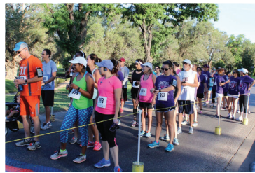
5k runners line up at the start line