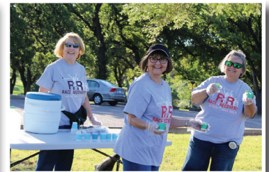
Volunteers from St. Paul UMC helped pass out water to participants